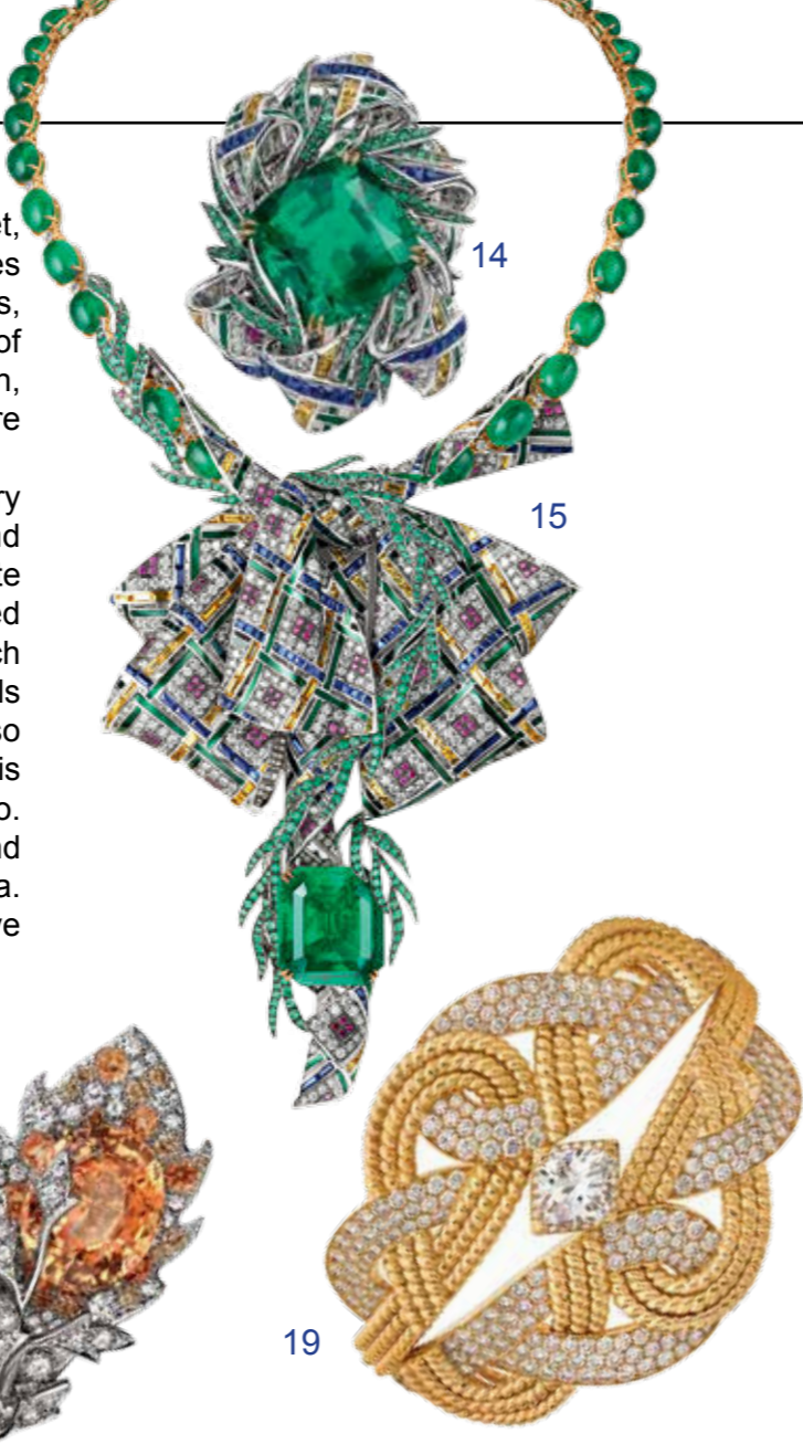
14. Ring in white and yellow gold, lacquer, 11.74-ct Colombian emerald, rubies, emeralds, baguette-cut sapphires, yellow sapphires and diamonds by Chaumet. 15. Transformable necklace in white and yellow gold, lacquer, 28.98-ct Colombian Muzo emerald, 39 cabochon emeralds from Zambia, rubies, emeralds, baguette-cut sapphires, yellow sapphires and brilliant-cut diamonds by Chaumet. 16. Ring in white gold and yellow gold, 10.11-ct Ceylon Padparadscha sapphire, 7.37-ct violet Ceylon sapphire, Uмба garnets, diamonds (colorless and champagne) by Chaumet. 17. Ring in pink gold and lacquer, 4.83-ct Mozambique ruby, six ruby cabochons (1.99, 1.60, 1.26, 1.24, 1.17, and 0.96 cts), two square-cut Mozambique rubies (0.77 and 0.75 ct), two rhodolite garnets (1.60 ctw), round and baguette-cut rubies and diamonds by Chaumet. 18. Necklace in white and yellow gold, 29.77-ct morganite, 23.38-ct chrysoberyl, 12.87-ct Imperial topaz, 12.21-ct pink tourmaline, 10.67-ct tanzanite, 2.12-ct pear-shaped DVVS2 diamond, thirty EFVVS diamonds (0.55 to 0.71 ct), Uмба garnets and round diamonds (champagne and colorless) by Chaumet. 19. Golden Braid bracelet in 18K yellow gold, 4.22-ct diamond and 273 brilliant diamonds by Chanel.

For Chanel, it was about the complicated love story between Gabrielle and Hugh Grosvenor—the second Duke of Westminster, who was Chanel's lover in the late 1920s. One of the richest men in Europe, he possessed a legendary large sailing ship, the Flying Cloud , which gave its name to this collection of more than 60 jewels mainly honoring diamonds and sapphires. It was also during this period that the villa, La Pausa , was built. It is said that this house was a gift from the Duke to Coco. Whatever the story, she spent long periods there and welcomed many French and international intelligentsia. The house has also returned to Chanel, which will have it completely restored.