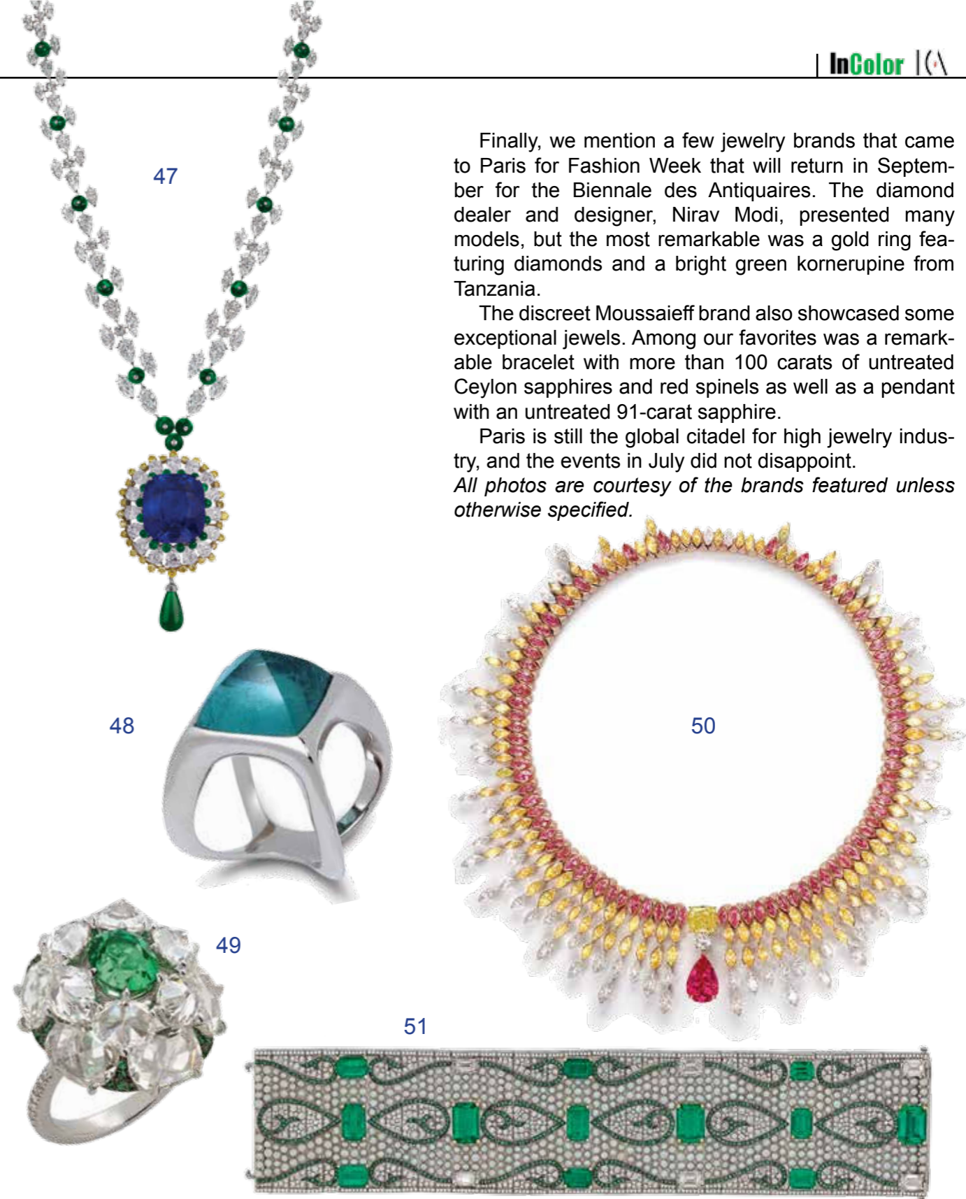
47. Important Gold necklace featuring diamonds, emeralds and a 91-ct untreated Burmese sapphire by Moussaieff. 48. Phoenix white gold ring set with tourmaline by Amelie Viaene. 49. White gold ring featuring diamonds and a rare vivid green kornepurine by Nirav Modi. 50. Sunlight Journey necklace in 18K red, pink, yellow gold and platinum set with a 10.09-ct pear-shaped red spinel from Tanzania, a 6.63-ct cushion-cut yellow diamond (FVY-VS2), a 0.80-ct brilliant-cut diamond (F-VVS2), red spinels, yellow and colorless diamonds by Piaget. 51. White gold bracelet featuring diamonds, emeralds and natural pearls by Nirav Modi.

Finally, we mention a few jewelry brands that came to Paris for Fashion Week that will return in September for the Biennale des Antiquaires. The diamond dealer and designer, Nirav Modi, presented many models, but the most remarkable was a gold ring featuring diamonds and a bright green kornepurine from Tanzania.