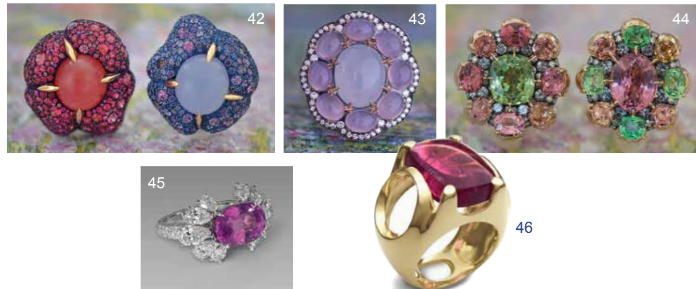
40. Yellow gold earrings set with amethysts and tourmalines by Anais Rheiner. (Photo: Dominique Dubois) 41. Yellow gold ring set with tanzanite by Anais Rheiner. (Photo: Dominique Dubois) 42. Yellow gold and titanium earrings, featuring a 14.15-ct chalcedony, a 17.07-ct rhodochrosite, sapphires (6.90 ctw) and spinels (6.33 ctw) by Arteau Paris. 43. Red gold and blackened silver ring featuring a 7.89-ct Burmese jade cabochon, eight Namibian chalcedony cabochons (6.13-ctw) and diamonds by Arteau Paris. 44. Yellow gold and blackened silver earrings featuring a 6.05-ct Tanzanian spinel, a 5.07-ct tsavorite, four spinels from Madagascar (3.18 ctw), four tsavorites (2.47 ctw) and Burmese gray spinels (1.47 ctw) by Arteau Paris. 45. Pink sapphire and diamond ring in white gold by David Morris. 46. Ginza yellow gold ring set with tourmaline by Amelie Viaene.