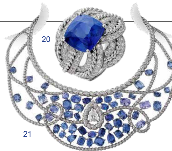
20. Azurean Braid ring in 18K white gold, 11.49-ct blue sapphire and 112 brilliant diamonds by Chanel. 21. Turquoise Waters necklace in 18K white gold, 2.58-ct pear-cut diamond, 12 cushion-cut blue sapphires, 34 oval-cut blue sapphires, three pear-cut blue sapphires, two round-cut blue sapphires and 1552 brilliant diamonds (23.84 ctw) by Chanel.

Secrets were on the agenda at Van Cleef & Arpels. The French house designed a collection of 65 pieces composed entirely of message jewelry, transformations and double reading. Puzzles, retractable elements and hidden mechanisms celebrated the ingenuity of the jewelers when it comes to the high-tech approach to creating such small and detailed objects.