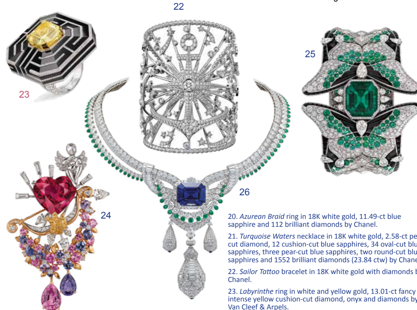
22. Sailor Tattoo bracelet in 18K white gold with diamonds by Chanel. 23. Labyrinthe ring in white and yellow gold, 13.01-ct fancy intense yellow cushion-cut diamond, onyx and diamonds by Van Cleef & Arpels. 24. Secret des amoureux brooch in 18K gold (white, pink and yellow), diamonds, colored sapphires, a 2.74-ct pink-orange Ceylon sapphire, 1.36-ct purple Ceylon sapphire and a heart-shaped 12.04-ct rubellite by Van Cleef & Arpels. 25. Papillon Secret Watch in white gold, diamonds, emeralds, black spinel, onyx, white mother-of-pearl, featuring a 14.57-ct Colombian emerald, manual winding mechanical movement. One of the butterflies hides a mother-of-pearl dial under its lower wing, unveiled with the fingertips by Van Cleef & Arpels. 26. Pégase necklace in white gold, diamonds, emeralds and a 45.10-ct Ceylon sapphire. Detachable clip. Within the central pendant is hidden a miniature Pegasus in white gold. The mythical winged horse can be kept secret, revealed in broad daylight, or suspended from a clip, in the company of two other detachable pendants by Van Cleef & Arpels.

Among the spectacular stones was an untreated 45-carat Burmese sapphire, a no-oil 10.17-carat Zambian emerald and a remarkable combination of natural untreated sapphires from Madagascar weighing more than 42 carats. On the brand's YouTube channel, small videos present the jewelry in a way that explains the mechanisms and hidden messages.