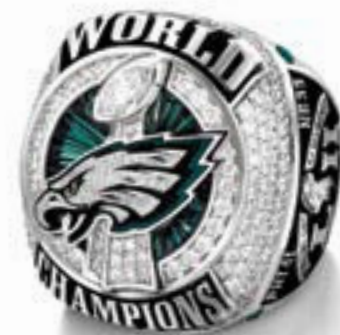
From top: AgriJewelry 14-karat gold pendant with a yellow stone made by melting resin and corn meal. agrijewelry.com ; Jostens Philadelphia Eagles white gold and diamond ring. jostens.com ; Oscar Heyman snowman brooch in gold, diamonds, rubies, sapphires and onyx. oscarheyman.com

The Super Bowl — the final showdown in the National Football League (NFL) championship — is one of the country's biggest events. Millions of Americans gather in front of their TVs on the first Sunday in February to root for their teams. With star-studded halftime shows and ads costing millions of dollars, it's no surprise that the Super Bowl has inspired some extravagant jewelry — particularly the gem-set rings the NFL commissions for the winners. In 2015, each New England Patriots championship ring cost over $36,000 and boasted 205 diamonds totaling 4.85 carats. The primary manufacturer of Super Bowl rings is Jostens, which has produced over 30 different editions since 1966. On the vintage market, some of them can exceed $100,000 — like at Gold & Silver Pawn Shop, which specializes in these rare collectors' items.