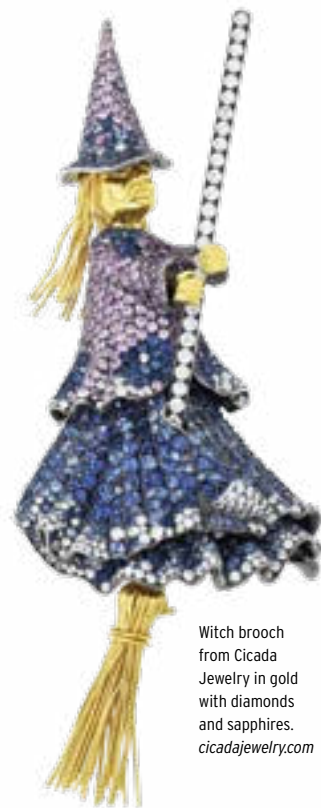
Witch brooch from Cicada Jewelry in gold with diamonds and sapphires. cicadajewelry.com

Three days that bring out the Americans people's patriotic side are the Fourth of July, when the US celebrates Independence Day; Memorial Day, which pays tribute to fallen soldiers on the last Monday in May; and Veterans Day on November 11, honoring military vets. On these holidays, it's traditional to fly the national flag, and jewelry designers often reflect the red, white and blue theme in custom-made brooches with rubies, colorless diamonds, and sapphires. The vintage jewelry market may see rare pieces depicting the American eagle, the "V" for victory, or even small military vehicles. Both Oscar Heyman and Tiffany & Co. have produced some beautiful flag brooches and pendants that sparkle with national pride.